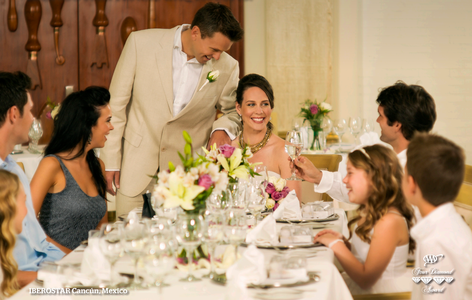
IBEROSTAR Cancún, Mexico